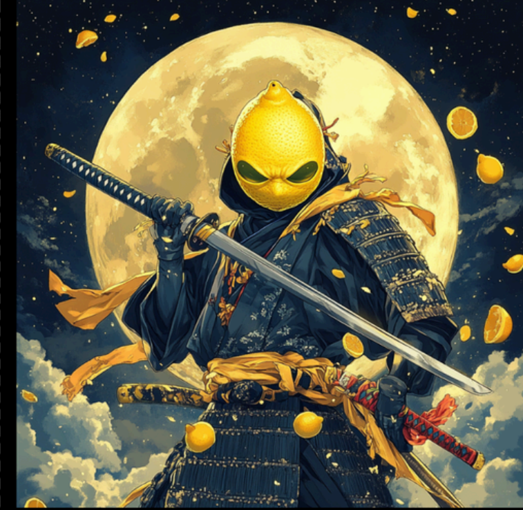
NAME: "SOUR" KUROSAWA