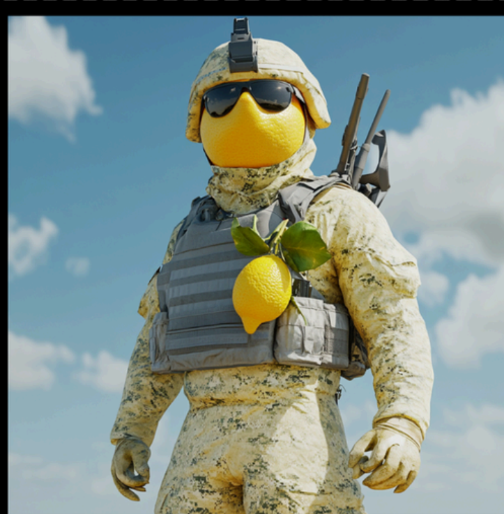
NAME: GEN. DWIGHT "LEM" EISENHOWER